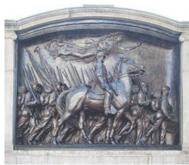
A monument to Robert Gould Shaw, whose leadership of the 54th regiment is featured in Charles Ives's Three Places in New England

The regiment is memorialized in Charles Ives's composition Three Places in New England . The first movement, “The Saint-Gaudens in Boston Common,” refers to the monument erected there in 1897 that honors Colonel Robert Gould Shaw and the brave men under