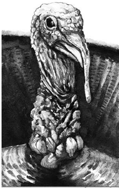
Illustration by Adelaide Murphy Tyrol