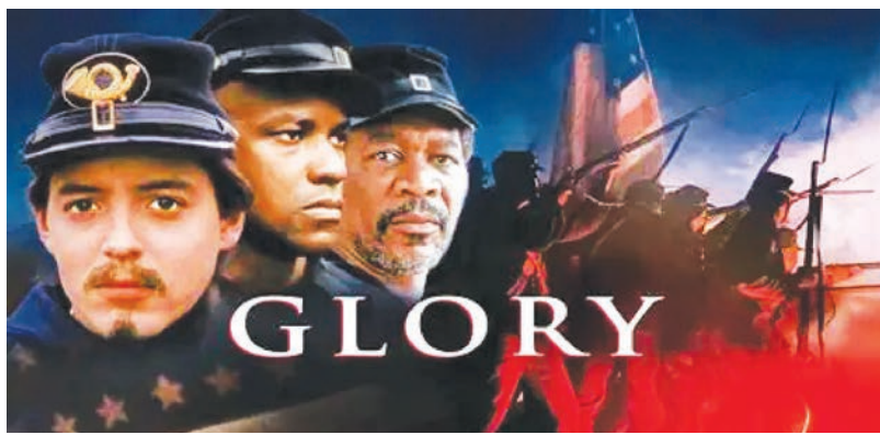
The 1989 film Glory will be screened on April 23 at Greenwood Features as part of Redding Celebrates America 250.